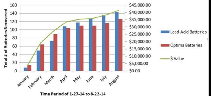
270 Batteries Recovered and over $41,000 Saved

The battery management program at Rush Trucks in Houston paid for itself in less than 3 months by dramatically reducing the number of new batteries purchased each month by 85%. Over a 7 month period, they recovered 270 lead-acid and Optima batteries saving over $41,000 in new battery purchases.